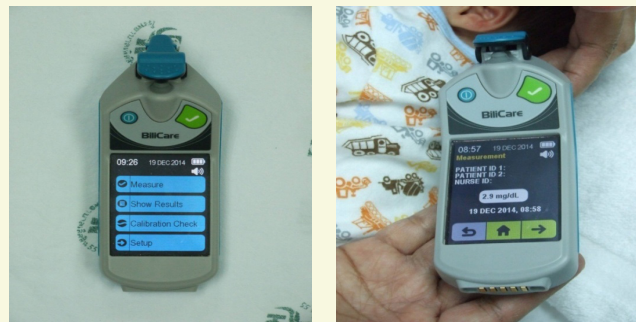
Figure 1 Transmission transcutaneous Bilirubinometer

Blood will be collected from participants' heel no less than 30 minutes later and measured for bilirubin level and recorded in the CRFs.