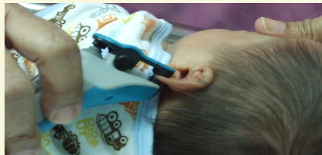
Fig 2 Transcutaneous bilirubin measurement at ear pinna