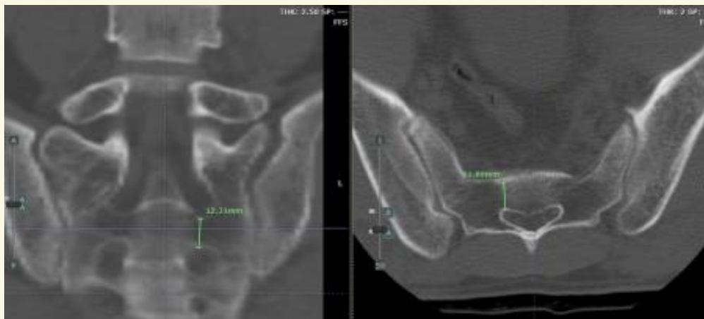
Figure 2 : S2 segment

The S2 segment (Figure 2): Width is measured in the axial view as the perpendicular distance from the antero-lateral corner of the sacral canal to the anterior cortex of the S2 segment using a cut CT scan with the narrowest corridor. Height is measured in the coronal view as the perpendicular distance from the highest edge of the first neural foramen to the superior cortex of the S2 segment using a cut CT scan with this corridor being the narrowest.