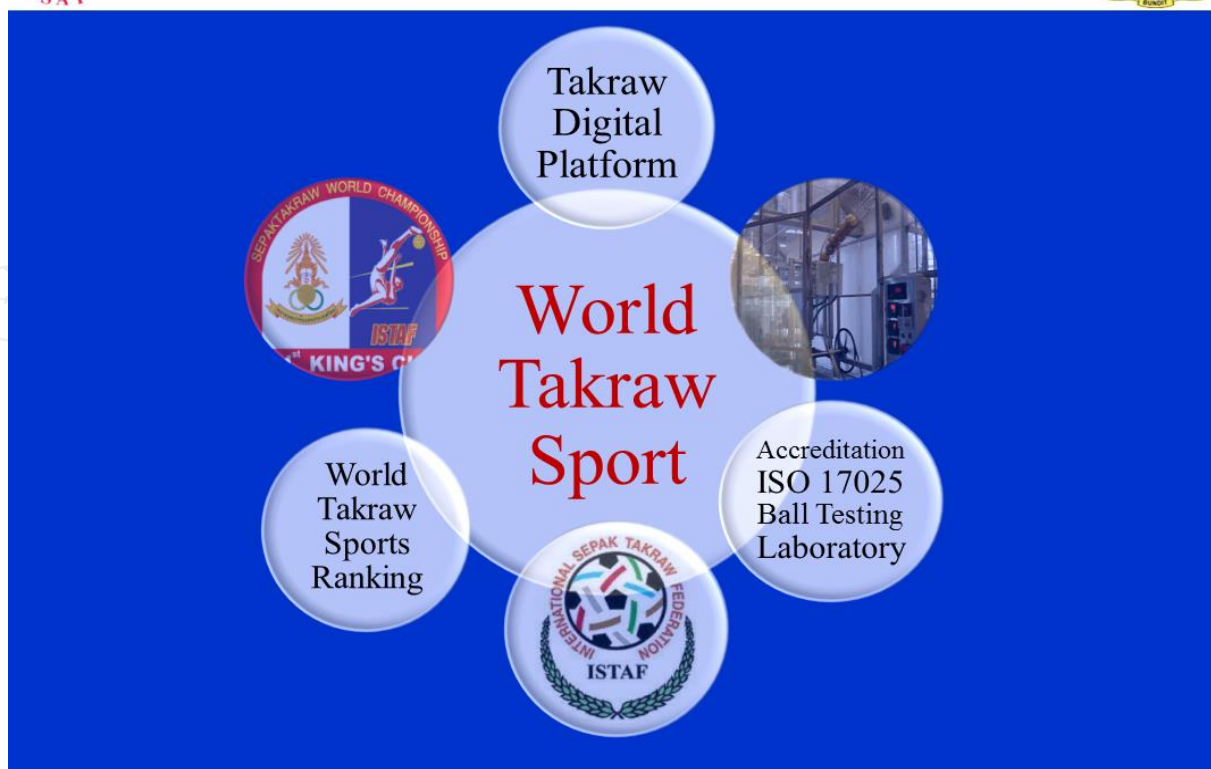
Figure 2. The Perspective Views of World Takraw Sport and Society. (Created on 2022 October, 5)

The schematic sports events of the world Takraw Sport society consensus and the movement of ISTAF to recognised into Olympic Games frontier was shown in Table 1. by experiential systematic review, the new ST - sport (in Takraw main category) event. Governing body established ISTAF in 1988 era. Moreover, ST - Summit 2019 by ISTAF: Olympic channel welcomes six - sports governing bodies including ISTAF Law of the game 2016 v 1.0 going on.