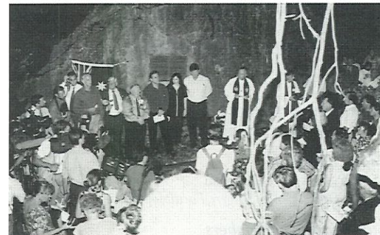
Photographs taken at Buddhist religious funeral ceremony at Wat Chaichumpol in Kanchanaburi for the late Sir Edward Dunlop.