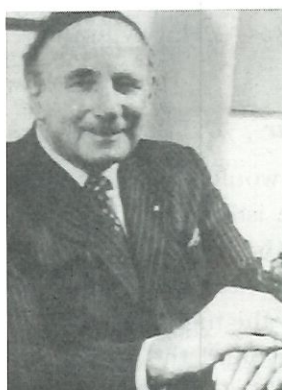
Sir Ernest Edward Dunlop