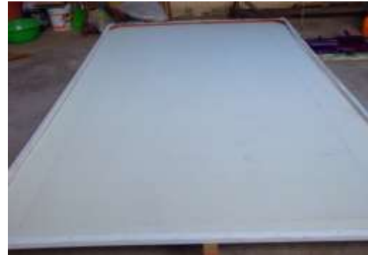
6. mold on the canvas with the printing process.