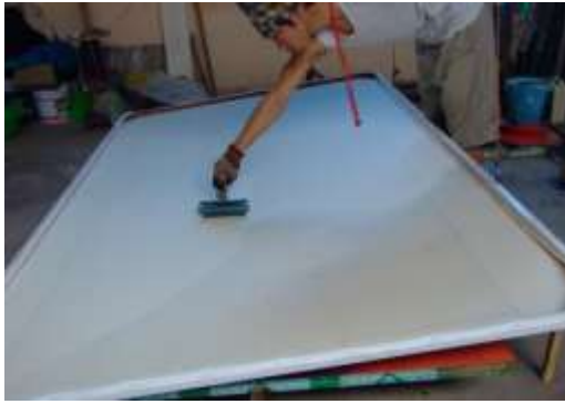
9. Gently open up the view to the finished print.