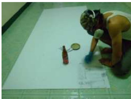
3. rag to dip in the thinner, rubbing the back of the sketch.