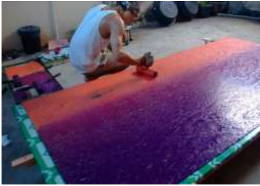
3. Roll the paint uniformly across the plate.