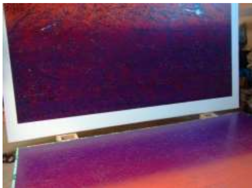
11. Check Zec look presentable again.