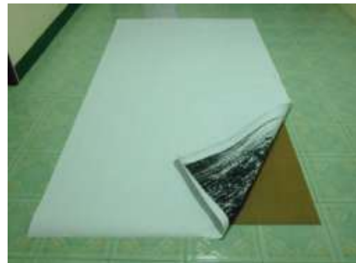
2. face down and organized image to to fit the mold.