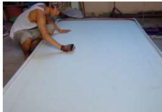
8. Exert over the regular print altogether.