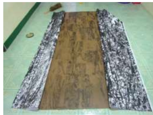
4. Lamb paper sketches out of the mold.