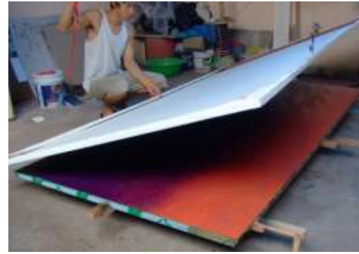
10. When you're satisfied, then turn out of the mold.