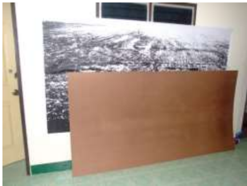
1. Expand the sketch to size as required.