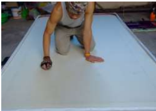
7. Start printing from the center of the work.