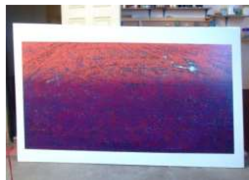
12. The printed works are finished. Just type in the following colors