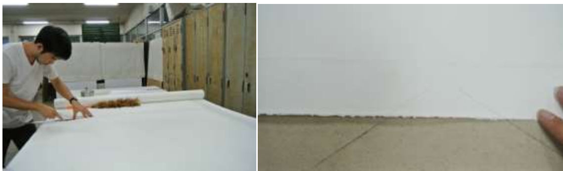
Figure 4: Preview preparing paper

5. Prepare a cotton fiber paper (FABIANO Printing paper) to the size that exceeds the mesonite slightly. And the positioning The layer printed paper to prevent movement.