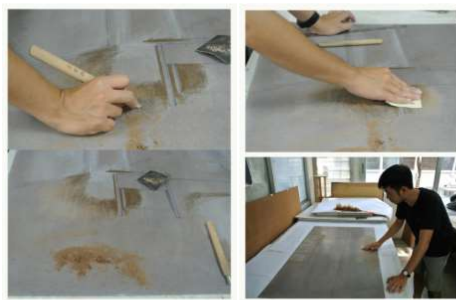
Figure 10: preview Contrary to the mesonite surface.

17. Remove the mesonite to create a trail by woodcut tools with a gentle scraping, sanding delicately positioned with light weight as possible. Clean up the mesonite.