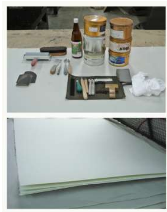
Figure 12: Preview material creative and technical processes.

According to all above contents, can be sum up that the creation of an art thesis on the topic “Sanctuary inside the soul” is the achievement of the study and the master degree creative thesis of Silpakorn University. The thesis has set goals, concept, style, technique and content that apply from knowledge of the study. Also, this thesis was improved to make the benefits to both myself and to the society.