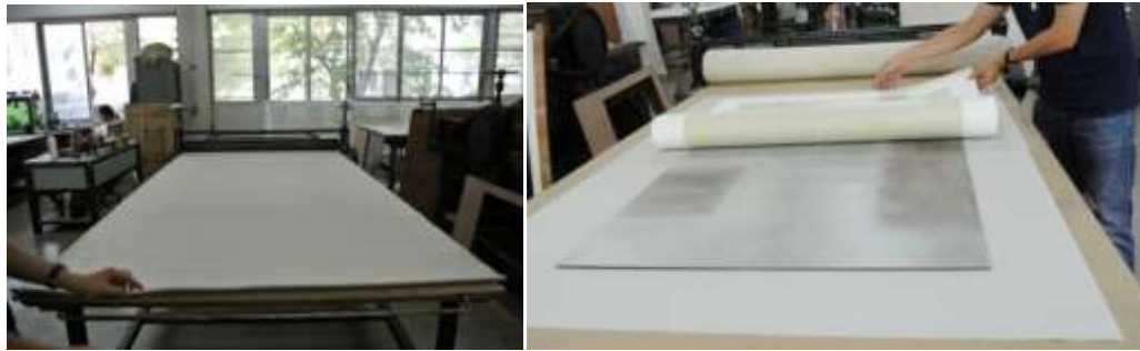
Figure 9: Preview printing process.

14. The case of the print can be set as desired.