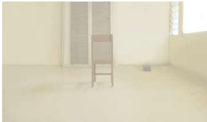
Figure 2: Creating a prototype preview sketch.

2 To customize the photos by using a knowledge of harmonization of shape and visual elements. These objects were expressed by the sense of a loan, thoughtful, reviewing and recording status, a storing of welfare and impressive stories.