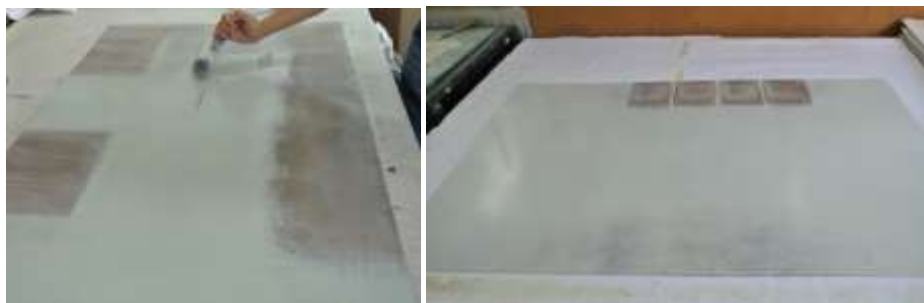
Figure 6: Preview printing process

8. Remove the mesonite roller rolling over the mold. The plane uniformly Not too thin or too thick