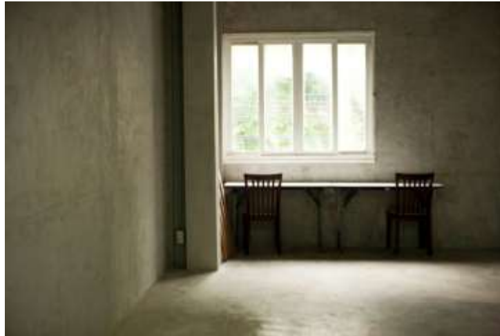
Figure 1: Photos physical prototyping space (sketch).

2 To customize the photos by using a knowledge of harmonization of shape and visual elements. These objects were expressed by the sense of a loan, thoughtful, reviewing and recording status, a storing of welfare and impressive stories.