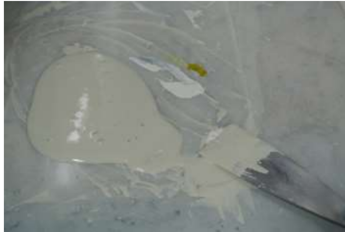
Figure 5: Preview color combinations

6. Using color inks, oil infection (Printing Ink) using a trowel to mix colors in light weight, the amount based on the number printed on the table are very slippery and strong like marble, glass