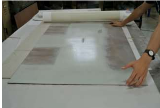
Figure 7: Preview printing process

10. Remove the mesonite paint roller then paste it to fit a predetermined position fit Then close the paper cotton fiber paper attached to the plane surface mesonite evenly across each of the barrel (baren) rubbing on the paper The paper next to the mesonite surface.