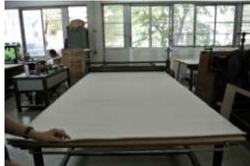
Figure 8: Preview printing process

12. Determines firmness of the printing press to force a uniform balance. Then rotate them regularly presses Do not stop during printing. Until the End.