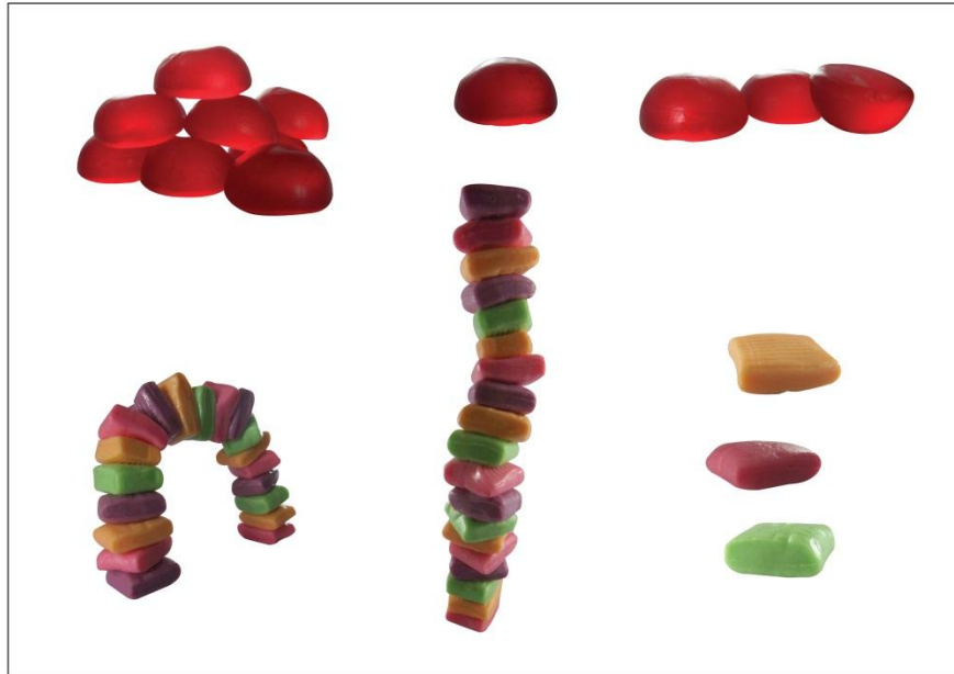
The picture shows the shape of the candy in works.