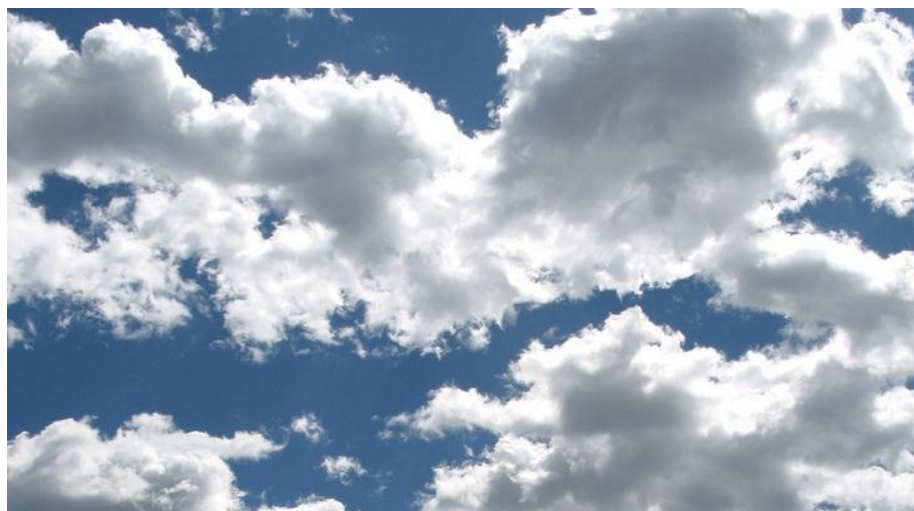
clouds in various places around the body.