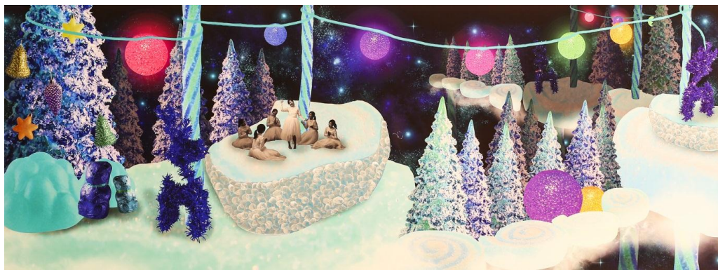
Title: In Perfect of my Dream #9

Technique: Digitalprint and Eraser Stamp