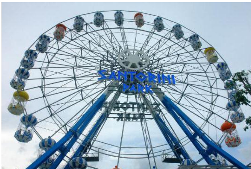
large Ferris wheel in an amusement park.