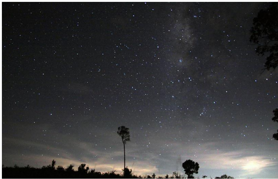
Sky at night in various locations.

I need to present my work in Semi Suralistic style through by technique digitalprint and eraser stamp on paper which is popularly happy, blissful, joyful and is in the world of dream and imagination.