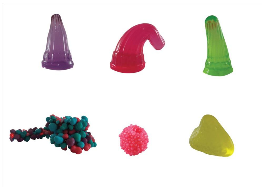
The picture shows the shape of the candy in works.