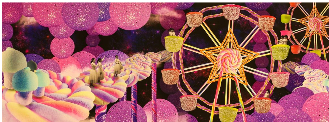
Title: In Perfect of my Dream #7

Technique: Digitalprint and Eraser Stamp