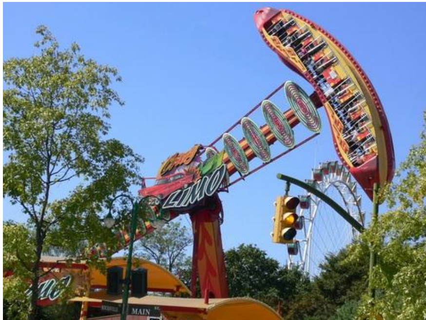
Vikings player a large amusement park.