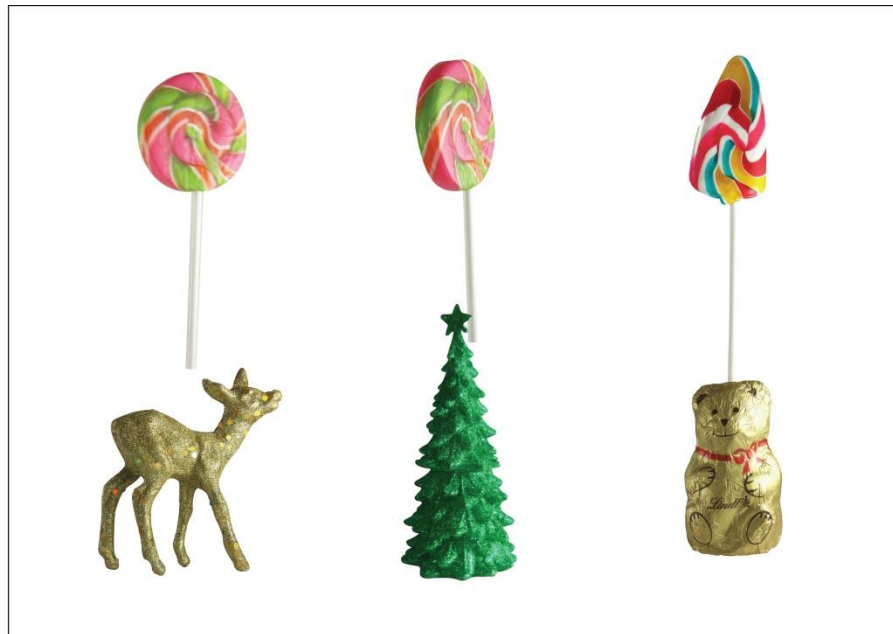
The picture shows the shape of the candy in works.