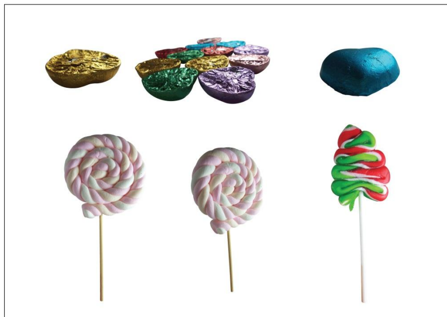
The picture shows the shape of the candy in works.