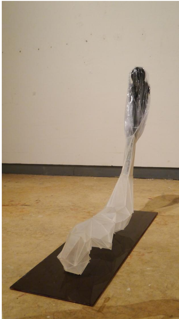
(left) Conversation with exhausted 35 x 120 x 85 cm. plastic sheet (cutting and joining them together) fiberglass