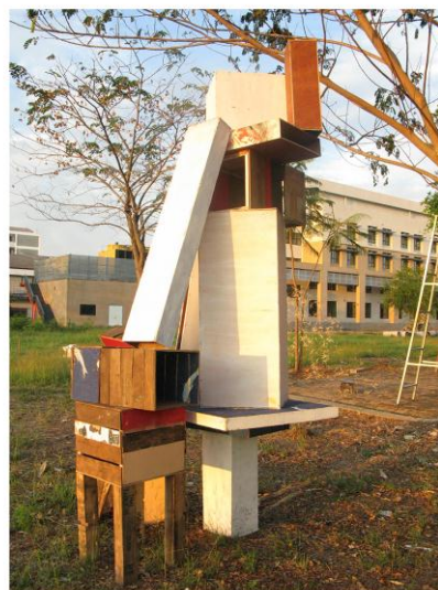
“Shape of the city in the distance.” 185 x 170 x 320 cm. wood chip 2010