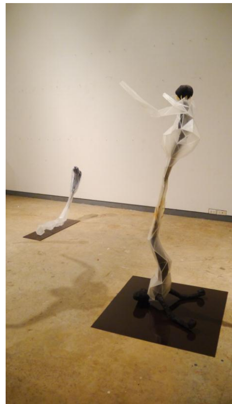
(right) Struggling with exhaustion 185 x 120 x 100 cm. plastic sheet (cutting and joining them together) fiberglass