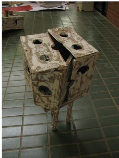
“gamble” 60 x 60 x 85 cm. wood chip 2009

The beginning of my creative works started from experimenting with both traditional and modern materials such as wood, steel, glass and plastic sheet. To expose to the properties of materials, I have learned that each material has its beauty and meaning. The reflection of stainless steel, the hardness and stability of the rock, the transparency of plastic sheets, all properties of these materials inspired me. I could imagine using some different materials into my works in order to express my ideas emotion.