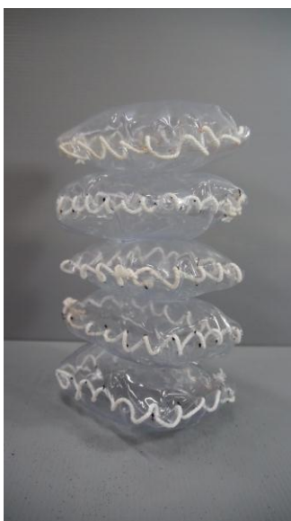
(up )Struggling with exhaustion

185 x 120 x 100 cm. plastic sheet (cutting and joining them together)