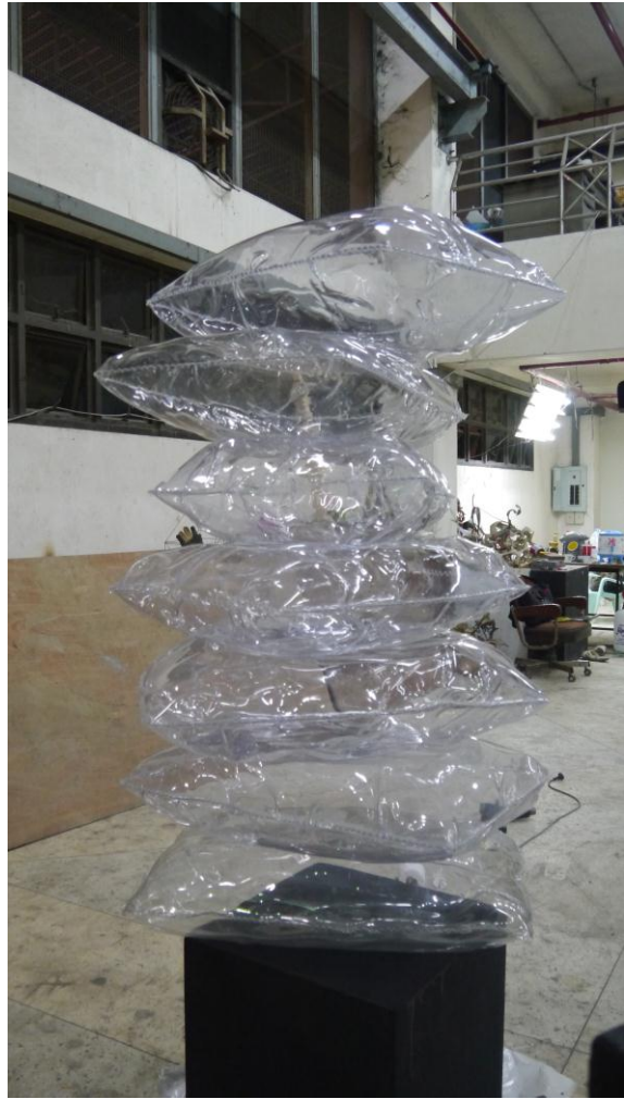
(up) Sustain 185 x 75 x 75 cm. transparent acrylic sheet , ligament