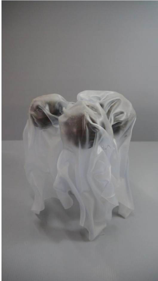
(Left) Wind blow gently

In the early stages of my working process, I found many possibilities to create shapes by employing transparent plastic sheet. Different technique can be applied such as blowing heat, Sewing sheets together, cutting and joining them together.