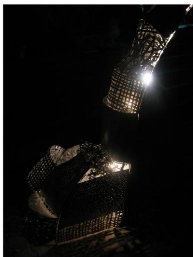
“hole light” 40 x 60 x 120 cm. Stainless lines , light 2008

The beginning of my creative works started from experimenting with both traditional and modern materials such as wood, steel, glass and plastic sheet. To expose to the properties of materials, I have learned that each material has its beauty and meaning. The reflection of stainless steel, the hardness and stability of the rock, the transparency of plastic sheets, all properties of these materials inspired me. I could imagine using some different materials into my works in order to express my ideas emotion.