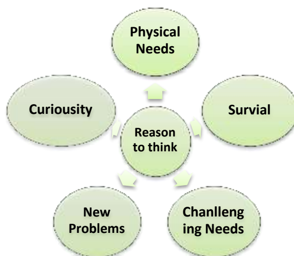
Figure 2 - Cause of Thinking

by applying some business elements for the best solution such as mind control, balancing, knowledge, experiences, comparison. Kriangsak (2549) emphasizes on that thought is very important for human to create and develop anything due to capability of human's thought. Humans' creativity leads us to know and benefits from new creations, followed by picture demonstrated why we have to think. John Howkins, 2008 and 2010 mentioned in Creativities Economic Thailand Conference that "All human kind has creativity" then bring the importance of creativity and creativity process linked to Maslow's Hierarchy of Needs at fourth step (Self-Esteem) and fifth step (Self-Actualization); setting new goals to be reached, when goals are achieved, it will bring happiness and joyful through all experience passed until reaching goals.