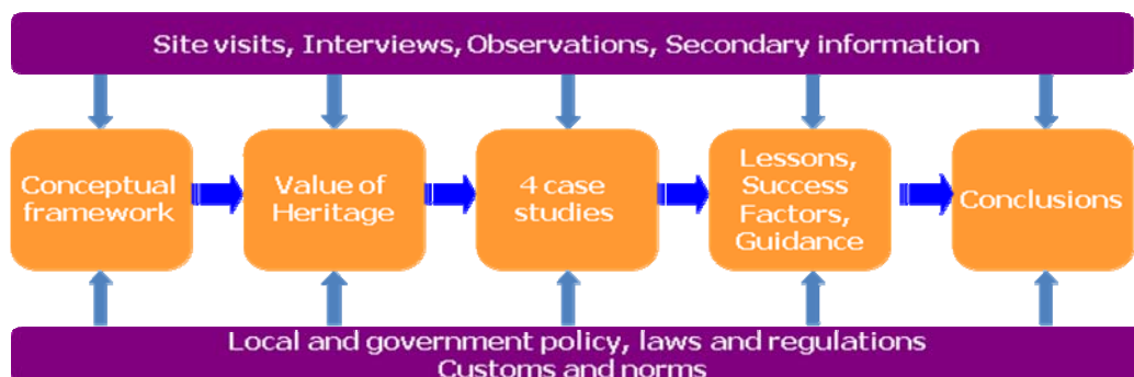
Figure 1: Structure of the report

The thesis is divided into 5 chapters which reflect the work and rationale of the study. It is set out in the concept diagram below.