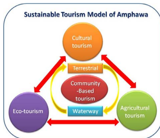
Figure 3: Sustainable tourism model of Amphawa

Amphawa defines sustainable tourism as tourism that respects and supports local culture, natural environments, place identity and an ability to generate income for people in the community. Below is a sustainable tourism model of Amphawa that integrates the three tourism concepts, 'cultural tourism', 'ecotourism' and 'agricultural tourism'. It utilizes and manages cultural resources to keep tourism benefits in the local community. All three tourism concepts would be managed as 'community-based tourism'.