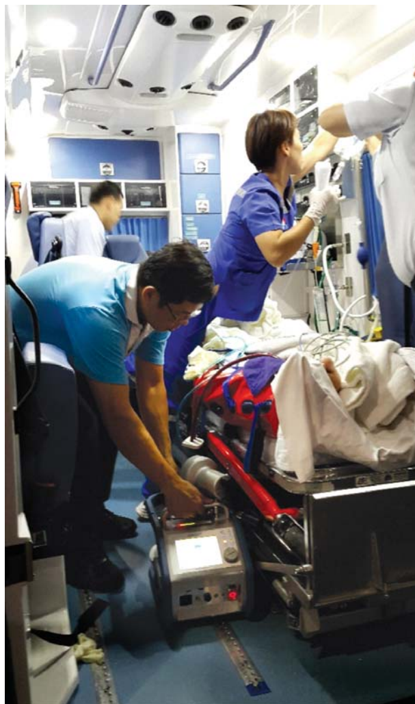
Figure 3: Ground transportation.