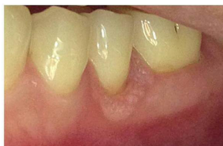
Figure 1: Intraoral examination showed a rough verrucous surface at buccal attached gingiva and free gingiva of the left second lower premolar region.

A 37-year-old Thai female presented with an asymptomatic, slightly raised white verrucous lesion, measuring 4x8 mm. in size at the buccal attached and free gingiva of the left second lower premolar region (Figure 1). Interdental gingiva between the left second lower premolar tooth and the left first lower molar tooth was involved by the lesion. It was found during a routine oral examination and the medical history was not remarkable. The patient denied any history of smoking and alcohol consumption. The clinical impression was verrucous hyperplasia and squamous papilloma. An incisional biopsy was taken from this verrucopapillary lesion to rule out dysplasia and carcinoma.