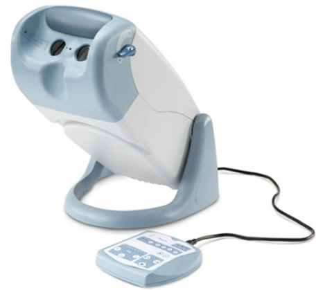
Figure 1: Titmus vision screener 6