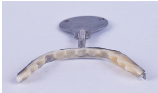
Figure 2 The para-occlusal clutch with impression index

The statistical analyses of the recorded data were carried out using SPSS statistical software (SPSS 18.0, SPSS Inc., Chicago, IL, USA). According to the Angle's classification, the normal distribution of data was examined using the Shapiro-Wilk test. Levene's test for equality of variances was also performed. The statistical analyses of SCI for the Angle's classification