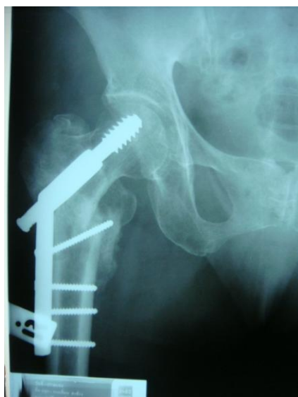
Fig. 2 Radiograph at 6 months after treatment showing a collapse and break of the lateral cortex

For intact lateral cortex fractures in the SHS group, one patient with wound infection required antibiotics and debridement and one patient required reoperation due to failure of the implant. In 45 broken lateral cortex fractures, one patient in the PFNA group had a superficial wound infection without reoperation, and two patients in the SHS group required reoperative surgery both due to a collapse and cut through (Fig. 2). The postoperative radiographs of a 70-year-old woman with an AO/OTA 31-A2 -type trochanteric fracture which demonstrated that the instrument failure (Fig. 3)