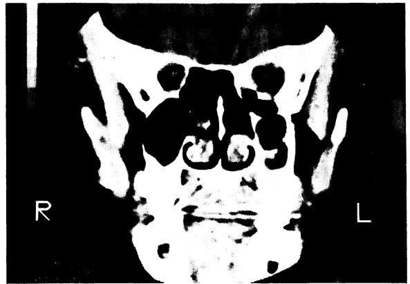
Figure 2 chronic sinusitis, polypoid mucosa and retentioncyst in maxillary sinus