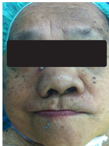
Figure 1 show right facial swelling and small ulcer on the right side of her face

Computed tomography (CT) scan of the paranasal sinuses demonstrated a large heterogenous enhanced lesion at the right hard palate and maxillary sinus with bony destruction measuring 5.5 x 5.3 x 5 cm. in transverse, AP and vertical diameters, respectively (Figure 2). Medially, the expanded