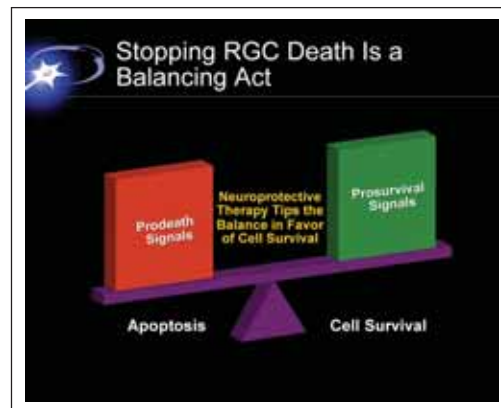
Fig 3. Balancing between apoptosis and cell survival

Glutamate is a neurotransmitter that is essential in the communication among neurons. Neurons communicate by using electrical and chemical signals. Electrical signals involve action potentials, whereas chemical signals include neurotransmitters and neuromodulators. Changes in cell