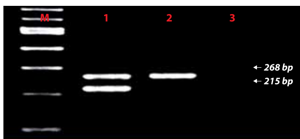
Fig 1. C-PCR assay of GSTM1 . The normal genotype [lane 1: 268 bp ( \beta -globin) + 215 bp ( GSTM1 )] and null genotype [lane 2: 268 bp ( \beta -globin)] of GSTM1 are examined on 2.5% agarose gel electrophoresis by the presence and absence of the GSTM1 band. Lane 3: a negative control. M: a 100 bp size marker.

Actually, GSTM1 polymorphism is commonly detected by using the conventional polymerase chain reaction (C-PCR) assay. However, this assay is not suitable for a mass screening since it is time consuming and is not safe as it uses a toxic chemical. Recently, the real-time R-PCR assay has been suggested to be an advantageous method for detection of genetic polymorphism of various cancer-susceptibility genes with a faster and safer performance. Ko et al., have developed the real-time R-PCR assay using the hybridization probes technology for a rapid detection of GSTM1 , GSTT1 and GSTP1 . 27 Although, this method is highly sensitive and specific, it is not practical for the mass screening since the probes are quite expensive. Therefore, an inexpensive R-PCR assay by using SYBR green I fluorescence and melting curve analysis technology is proposed to be an appropriate method for mass screening for the NPC high-risk group. The specific aim of this study is to establish the R-PCR assay by using SYBR green I fluorescence and melting curve analysis for GSTM1 polymorphism detection in Thai NPC and to confirm the results of this assay with the results of the C-PCR assay.