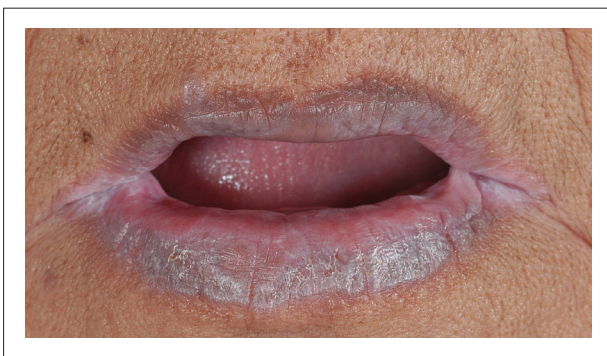
Fig 1. Physical examination revealed generalized well-defined scaly violaceous plaques on lower lip.

Most adverse reactions of imatinib mesylate including nausea, abdominal pain, diarrhea, myalgia and edema (commonly involving the periorbital areas and lower extremities) which are mild to moderate. 2 Approximately 31-44% of patients taking imatinib mesylate experience cutaneous reactions. 3 The most common cutaneous reaction is a maculopapular rash affecting the forearms and trunk. 2 Other cutaneous reactions include hair hypopigmentation, pruritus and pityriasis rosea-like eruption. 4,5 Severe cases with acute generalized exanthematous pustulosis, exfoliative dermatitis and Stevens-Johnson syndrome have also been reported. 6-8