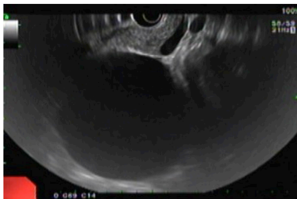
Fig 2. Endoscopic ultrasonography showing large thin wall cyst without septation or nodule at antero-lateral to second part of duodenum and no demonstration of its origin.

The patient underwent a complete excision by laparoscopic approach. Vertical supra-umbilical incision was made then balloon port 10 mm was placed and carbon dioxide was insufflated to establish a pneumoperitoneum of 12 to 14 mm Hg. Once the pneumoperitoneum was established, 10 mm 30 degrees laparoscope was applied. The initial evaluation revealed an encapsulated thin wall smooth surface cystic mass located in lesser sac between stomach, duodenum and transverse colon, 6 cm in diameter. Two of additional ports 5 mm were placed at epigastric area and left upper quadrant mid clavicular line, 5 cm from costal margin. Cyst was dissected from omentum and surrounding tissue. Feeding vessels from greater omentum were ligated by 2 hemolocks then