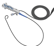
Storz Flex-XC1 Single-use ureterscope