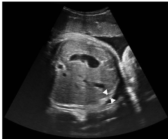
Fig. 1. Sonographic measurement of FASTT. The arrows describe the outer and inner edges of the echogenic subcutaneous fat line.

The fetal AC was measured in centimeters of circumference of fetal abdomen in the cross sectional view by ultrasonography through the liver at level of portal vein, stomach, and vertebral spine. The FASTT was measured in millimeters at anterior third of abdominal circumference by placing the cursor at outer and inner edges of the echogenic subcutaneous fat line (Fig. 1). The sonographic measurement was performed by Voluson GE ultrasound unit, 2-5 MHz wide band convex, curved array transducer.