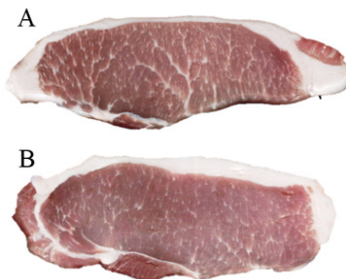
Figure 1 Pork loins from the longissimus thoracis muscle tissues with (A) high- and (B) low-intramuscular fat content.